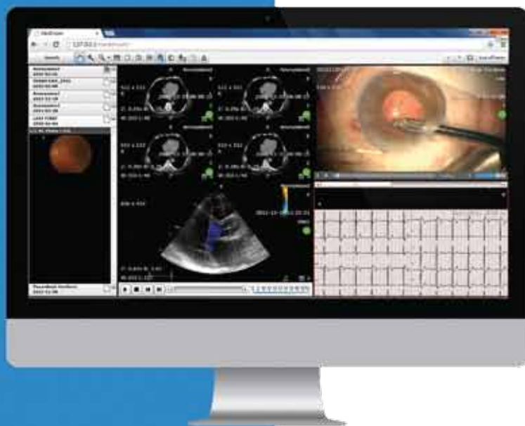
iMAGE Portal seamlessly integrates with Perennity DICOM, our other powerful software solution to manage Disc robots to output patient discs and/or USB drives. You will have the ability of publishing images to optical media (CD/DVD/BD/), USB, iMAGE Portal or all.

iMAGE Portal can be used in the local network (LAN) to provide internal site access to clinicians inside your own networked facility. iMAGE Portal can also be accessible from the outside, providing fast access to patients, physicians, radiologists, and all other authorized users. Additionally, you are able to host the iMAGE portal in the cloud, using any Internet service provider.