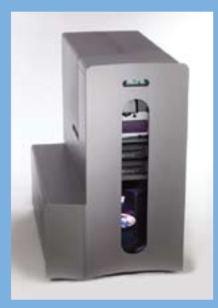
Rimage Producer III CD/DVD/BluRay autoloader